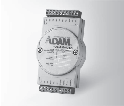
ADAM-4017+ CE FCC RoHS

8-ch Analog Input Module with Modbus 8-ch Thermocouple Input Module with Modbus 8-ch Universal Analog Input Module with Modbus