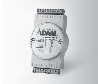
ADAM-4018+ CE FCC RoHS