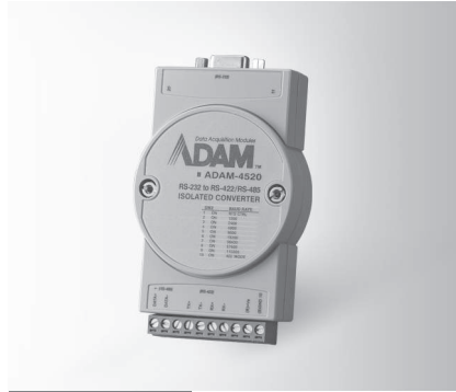
ADAM-4520 FCC CE RoHS COMPLIANT 2002/95/EC