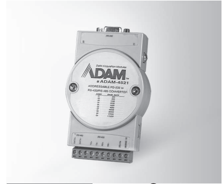
ADAM-4521 UL 05 LISTED ENEC RoHS COMPLIANT 2002/95/EC