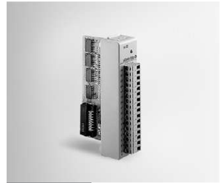
ADAM-5051 ADAM-5051D ADAM-5051S